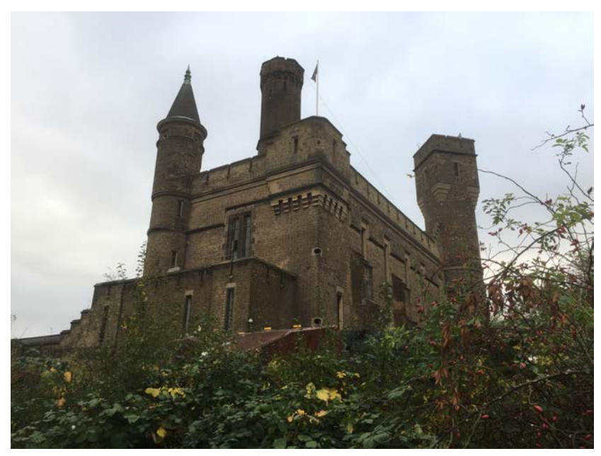
Castle Climbing Centre

After a good, long walk you will arrive to Green Lanes, where you can see a castle, a special one. It is the Castle Climbing Centre. One of the largest indoor climbing centres in Britain, if you like this sport.