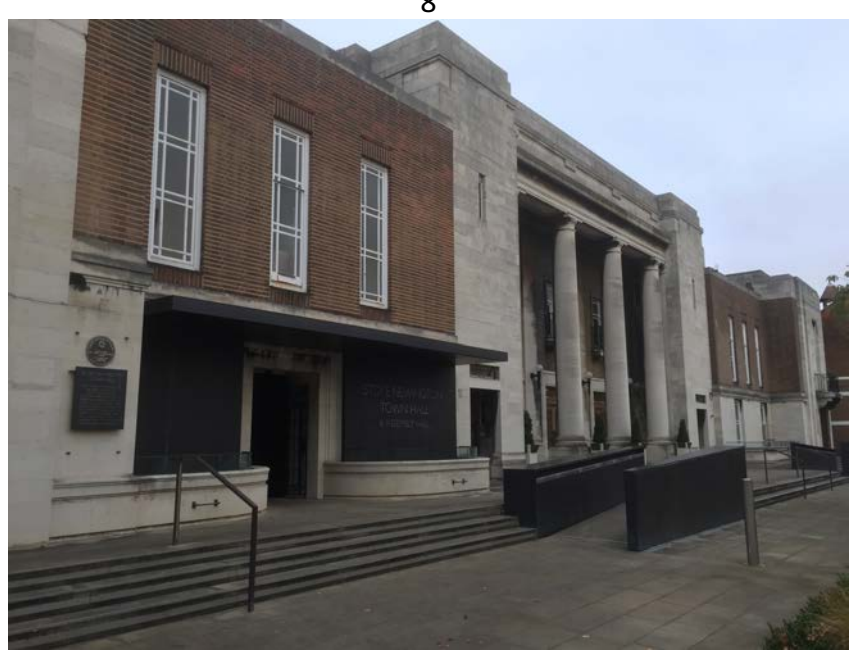
Town Hall. Survived the German bombing during the Blitz, because it was camouflaged by paintings

After your visit to these 3 places, take Stoke Newington Church Street, which goes along Clissold Park until you arrive to Green Lanes. Go first on the left and then, at your right, you arrive at Petherton Road.