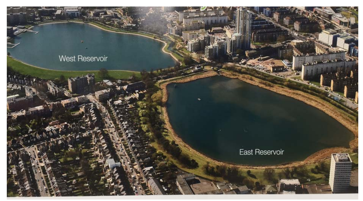
Lordship Rd separates the 2 lakes, that are water reservoirs for London.

This zone in plenty of water reservoirs, small lakes, rivers, and wet areas. It still provides drinking water to the capital.