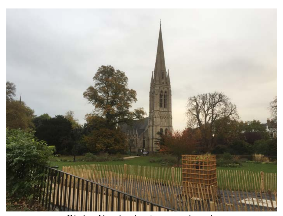
Stoke Newington's new church