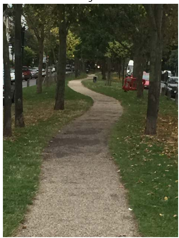
Petherton Road, was once a river.

Or the river that Hugh Myddleton built in 1613 for providing drinkable, fresh water to Londoners.