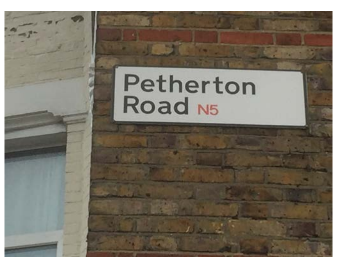
Take Petherton Road

After your visit to these 3 places, take Stoke Newington Church Street, which goes along Clissold Park until you arrive to Green Lanes. Go first on the left and then, at your right, you arrive at Petherton Road.