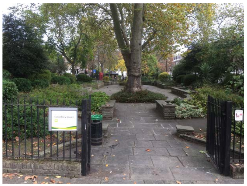
Canonbury Square, one of the most beautiful squares garden.

From Islington continue upwards on the Upper Street, towards Highbury.