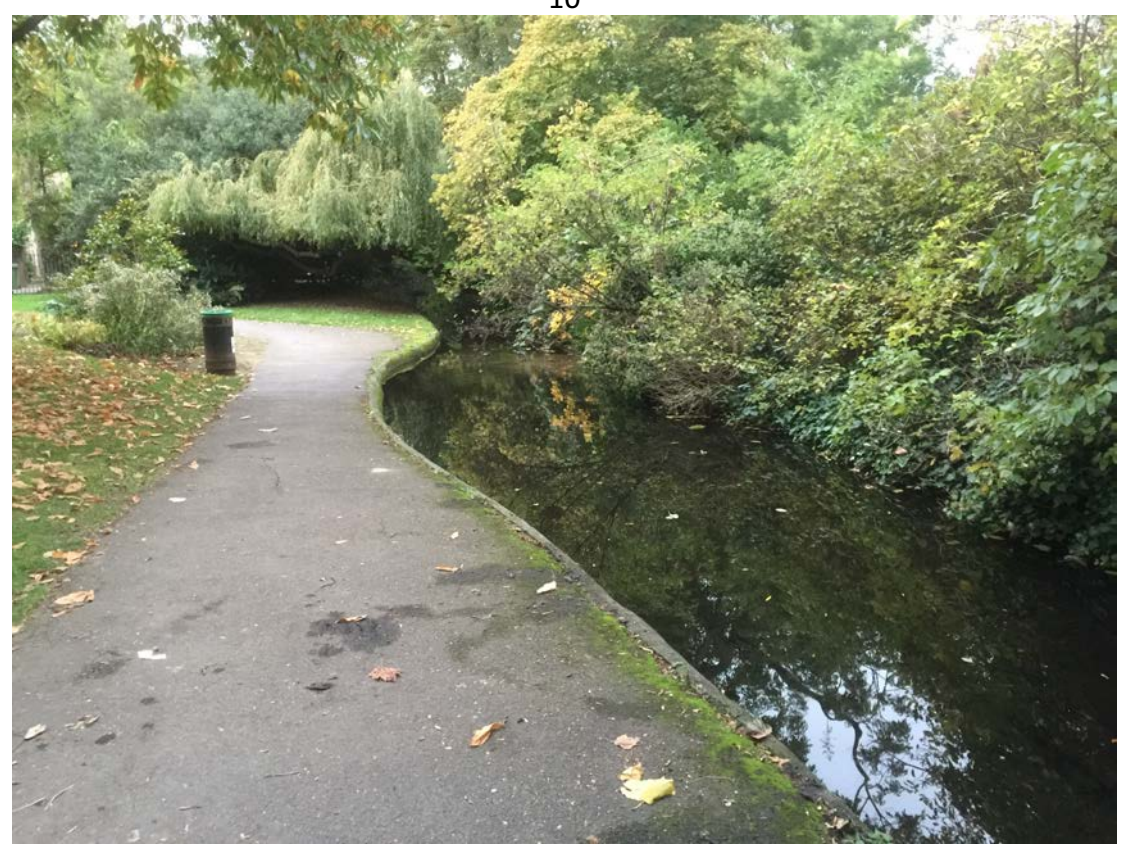
New River walk