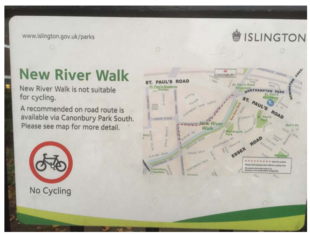
Map of the New River Walk

Carry on to Petherton Rd., it continuous to Wallace Rd and then to St Paul Rd. Cross it and go inside the New River Walk.