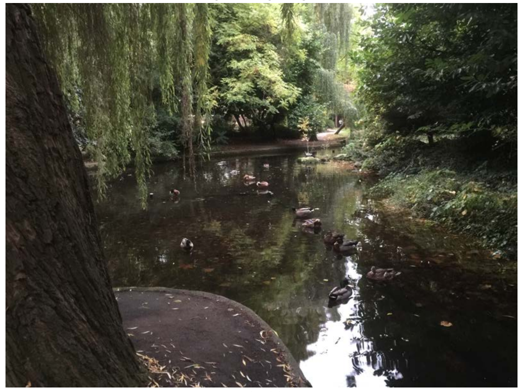
New River, mostly like a rain forest!

It is a joy to explore this small piece of land.