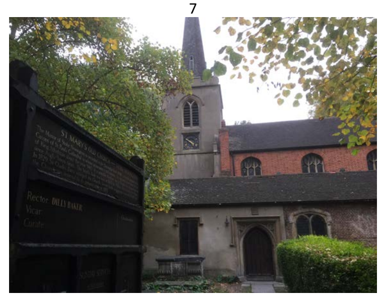
Stoke Newington's old church